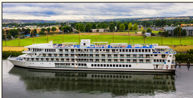
American Cruise Lines vessel at Port of Clarkston.

A vibrant and growing segment of the region's visitor industry