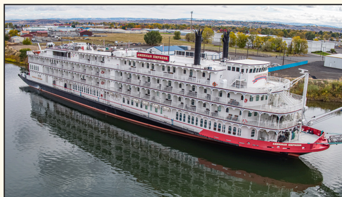
American Queen Steamboat Co. vessel at the Port of Clarkston.

A Needs Assessment conducted as part of this study recommends a range of steps to accommodate the anticipated growth and maximize economic impact. These include strategies to increase passenger overnights, promote tours and packages to cruise lines, coordinate with other Columbia/Snake ports, and upgrade vessel infrastructure, among others. The region is in an ideal position to capitalize on the opportunities represented by this growing industry.