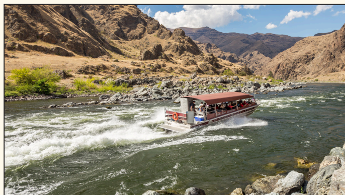
Hells Canyon jetboat tour.