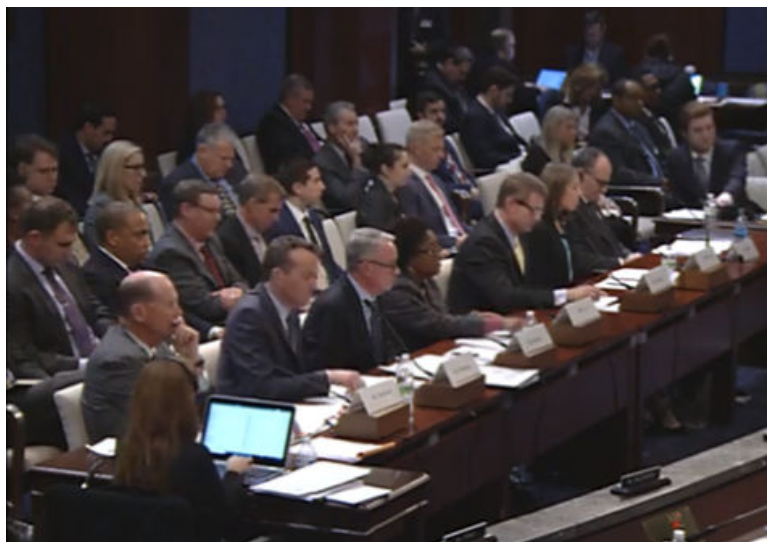
The panel during testimony