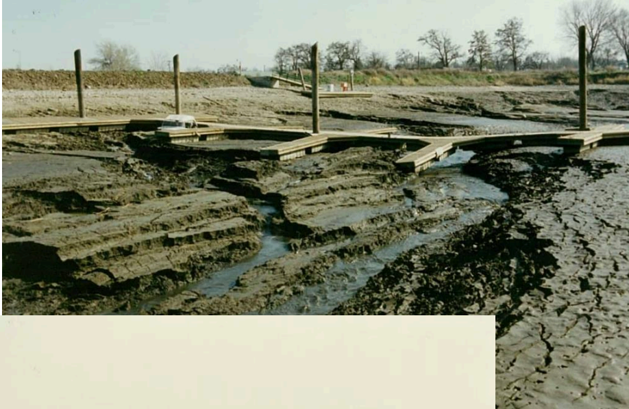
Exhibit 17 Photographs from 1992 Snake River Drawdown