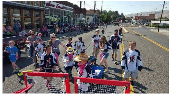
A group of youth hockey players participate in a Lewiston parade.

"The Port of Lewiston has bent over backwards to make accommodations for us," she said. "They've always listened to our concerns and tried to help us out."