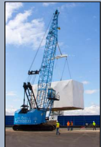
On April 14, crews moved the first of five units bound for the U.S. Navy onto a barge. The American Alloy project has provided new revenue at the Port of Lewiston and work for a number of local contractors.

are finding the Port's efforts to communicate our activities helpful and effective. We value your support for the Port's investments in local business growth and job creation, and we will continue showing you how that support is paying off for our community.