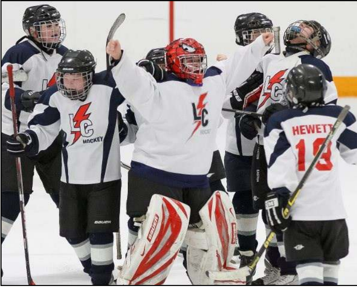
The LC Hockey Pee Wee Team (ages 11-12) celebrates a victory.

Hockey, public skating and other programs bring visitors to the valley and benefit local youth