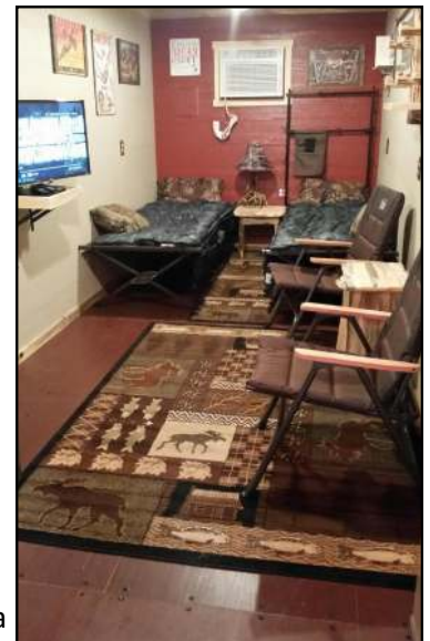
This model "Cabin in a Can" shows how an empty metal container can be transformed into a cozy living space. It was recently displayed at a home and garden show in Lewiston.