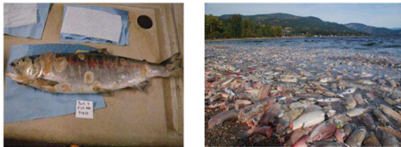
Figure 2: Fraser River sockeye with fungus patches, 2015, and Fraser River prespawning mortality due to high water temperatures, Shuswap Lake, BC, 2010.