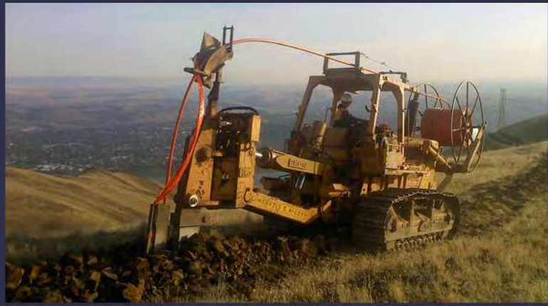
Installing High Speed Internet Infrastructure for Businesses and Residents