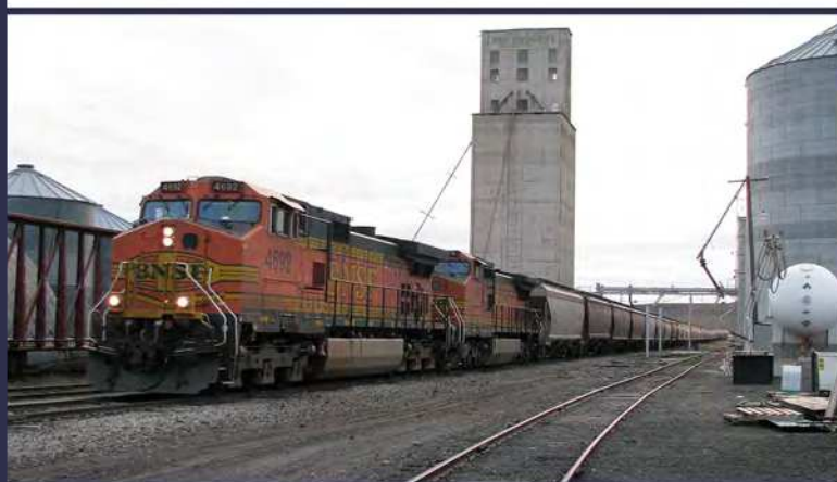
Investing in Multimodal Transportation