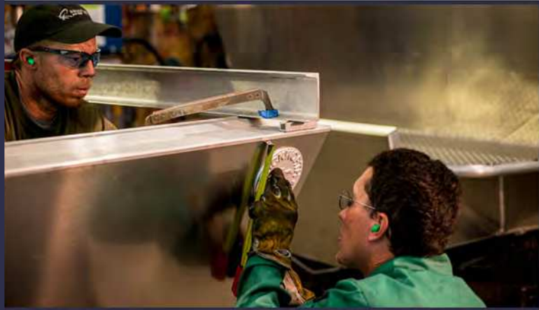
Supporting Private Sector Job Growth