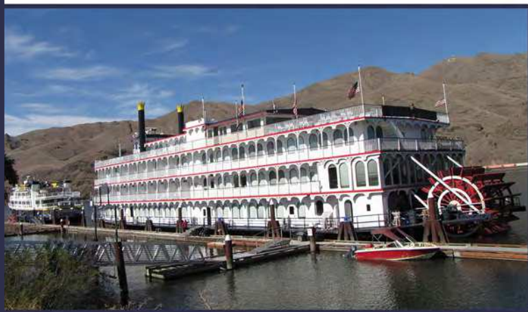
Promoting Recreation and Tourism