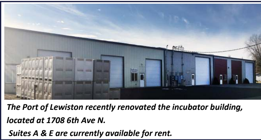
The Port of Lewiston recently renovated the incubator building, located at 1708 6th Ave N. Suites A & E are currently available for rent.