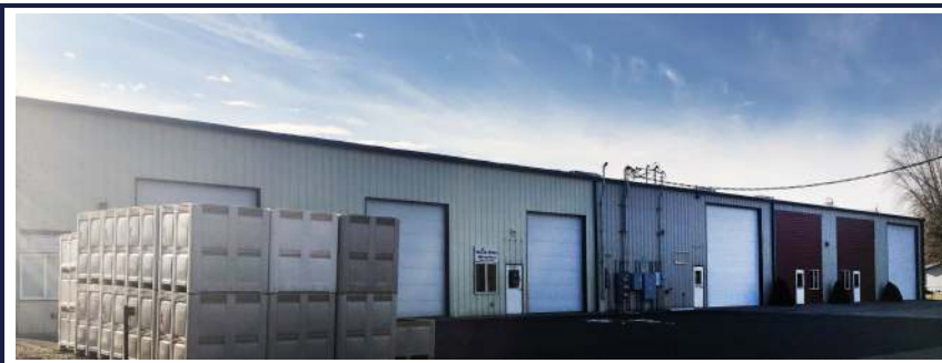
The Port of Lewiston recently renovated the incubator building, located at 1708 6th Ave N.

Suites A, D & E are currently available for rent.