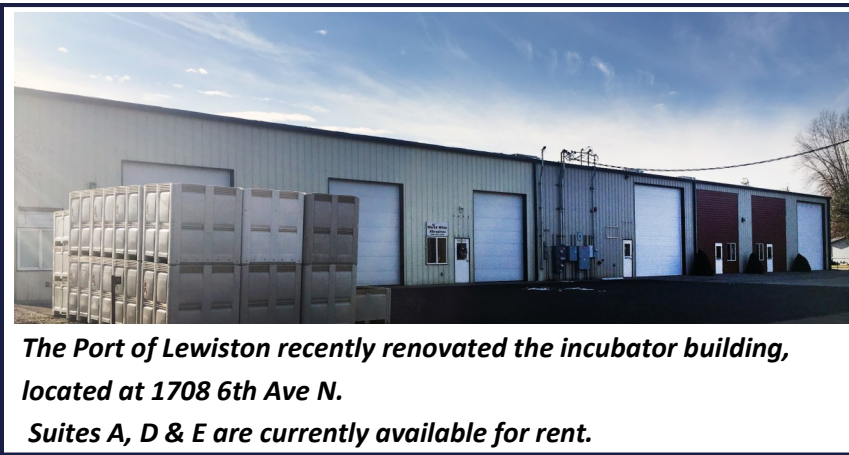
The Port of Lewiston recently renovated the incubator building, located at 1708 6th Ave N. Suites A, D & E are currently available for rent.