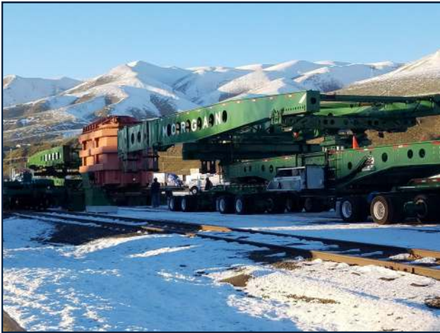
A BPA transformer, weighing approx. 320,000 lbs. and measuring 26' x 12' x 16.5' was transported by Union Pacific into town via the Port's rail line in early January. Omega Morgan is handling logistics to move the transformer to the Hatwai Substation near Genesee. Transformers convert high voltage electricity from power sources into lower voltage for use in businesses and homes.

Oversized cargo movements highlight the value of Lewiston's multimodal Port