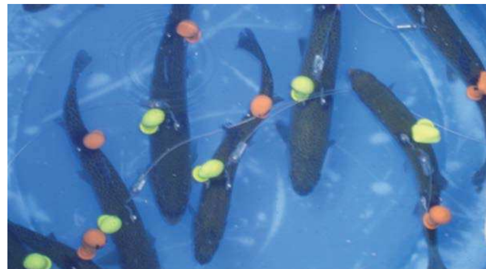
Juvenile fish (smolts) were balloon and radio tagged to validate survival and assist in redesigning and reshaping Ice Harbor Lock and Dam's spillbay #2.

Researchers recaptured 335 fish resulting in estimated 48 hour survival of approximately 98 percent and only one and a half percent injury. Relative to the 2005 study results, it is clear that the redesign and reshaping of spillbay 2 was a tremendous success and will provide a substantial fish passage benefit for out-migrating smolts passing Ice Harbor's most effective fish passage route.