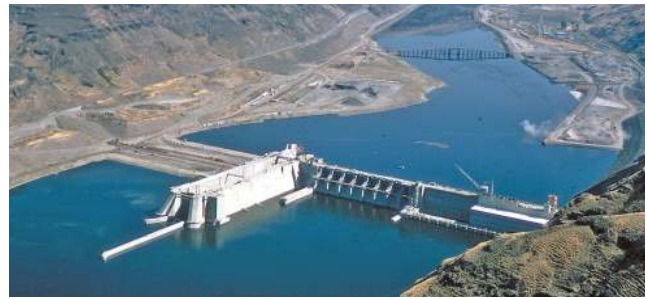
Lower Granite Dam — capacity 810 megawatts, energized in 1975

The Northwest Power and Conservation Council estimated the social costs of continued CO 2 emissions to the region over time. 4 Using the Council's social cost of carbon analysis, BPA estimates that replacing the four lower Snake River dams with gas-fired generation would have an associated social carbon cost of $98 million to $381 million each year.