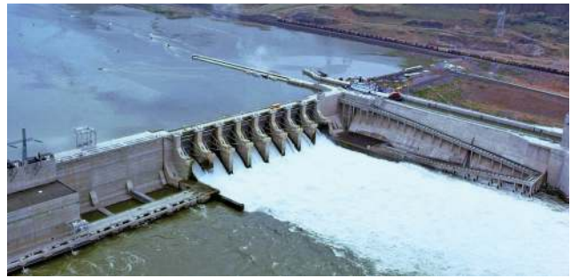
Lower Monumental Dam — capacity 810 megawatts, energized in 1969

The average energy output of a generator is also helpful when making comparisons. The four lower Snake River dams produce 1,004 average megawatts 5 each year. For comparison, the Boardman coal plant in Oregon provides 489 aMW. As an additional point of comparison, three