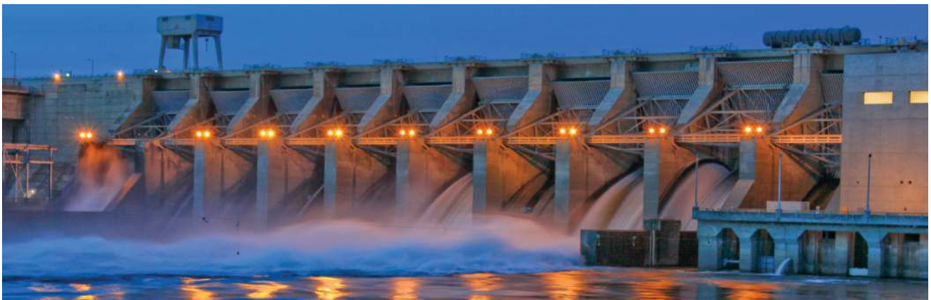
Ice Harbor Dam — capacity 603 megawatts, energized in 1961.

A key benefit of the federal dams is clean air. These dams produce a lot of energy and no greenhouse gas emissions. This gives the Northwest an environmental edge unmatched elsewhere in the country, where power production is largely based on fossil fuels.