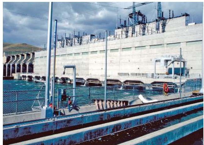
Little Goose Dam — capacity 810 megawatts, energized in 1970

The most technically and economically feasible generation replacement for the lower Snake River dams would likely be natural gas turbines. New natural gas generators could increase transmission congestion depending on their location, and would likely require additional transmission